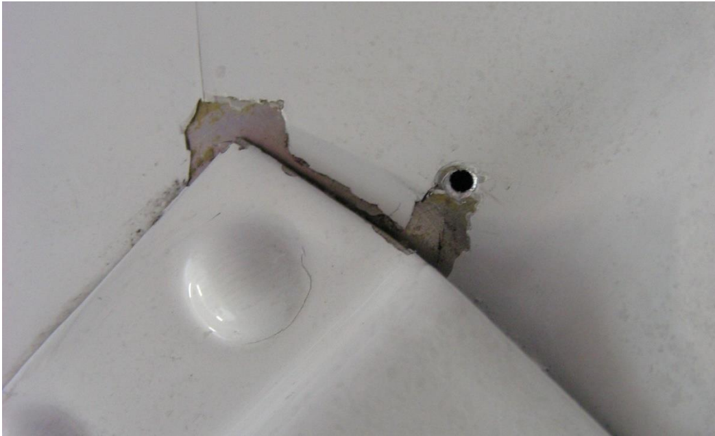
Fig. No. 2