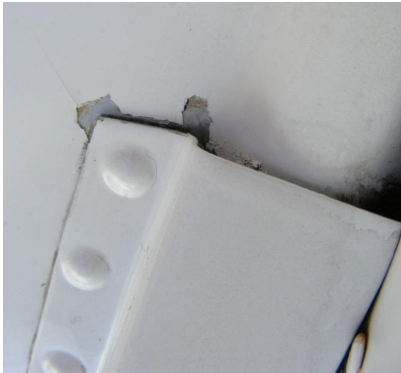
Fig. No. 1

The reported findings were considered by the Commission of Airworthiness and Reliability of ZLIN AIRCRAFT a.s. and its conclusion is that the cracks are repairable with no impact on airplane's airworthiness: